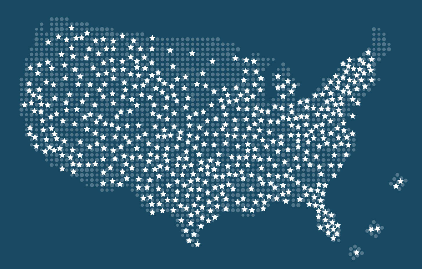
Practice without boundaries<sup>™</sup>

CureMD Healthcare - 80 Pine street, New York, NY 10005 (212) 509 6200 - curemd.com